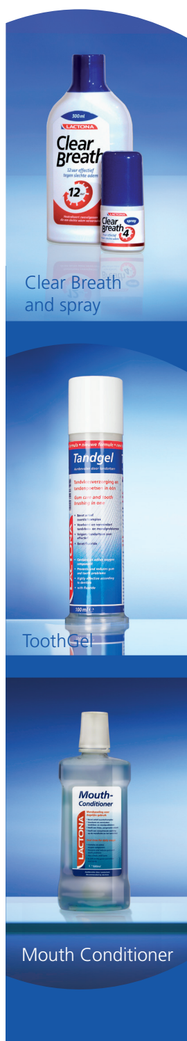
Clear Breath and spray

Lactona Clear Breath is also available as a Spray (25 ml.), which is effective for 4 hours.