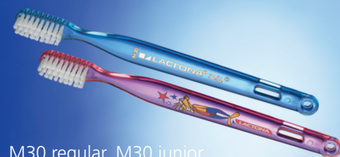
M30 regular, M30 junior