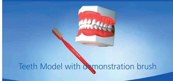
Teeth Model with demonstration brush