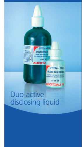
Duo-active disclosing liquid