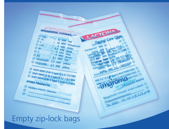
Empty zip-lock bags