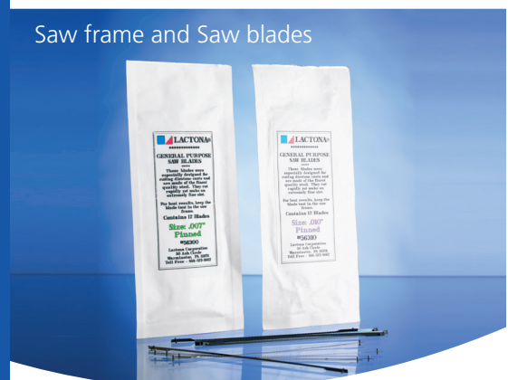
Saw frame and Saw blades

Package: a sealed envelope containing 12 pcs to prevent exposure to atmosphere.