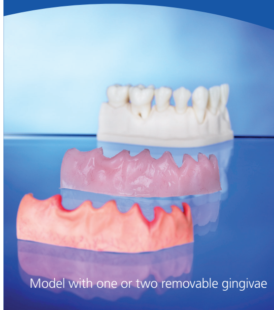
Model with one or two removable gingivae