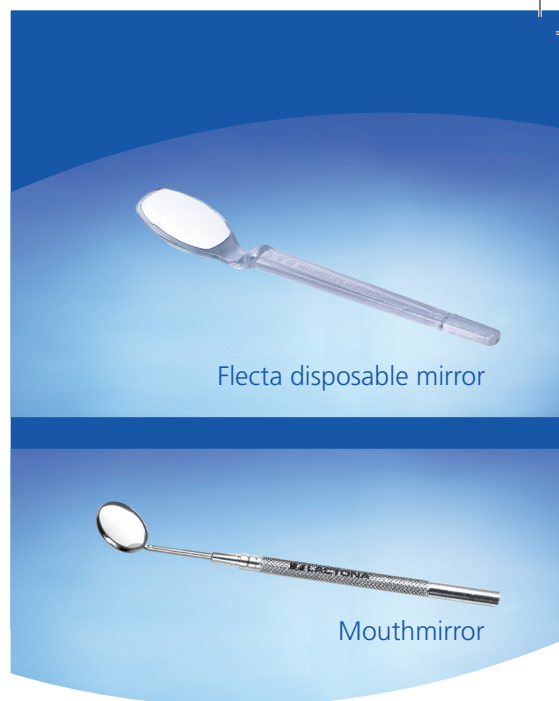
Flecta disposable mirror