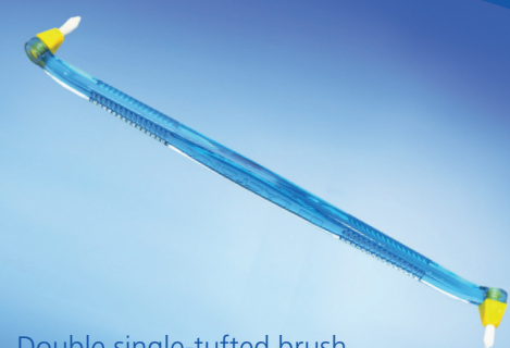
Double single-tufted brush

For cleaning difficult to reach areas, irregular or over crowded teeth and around orthodontic appliances and implants.