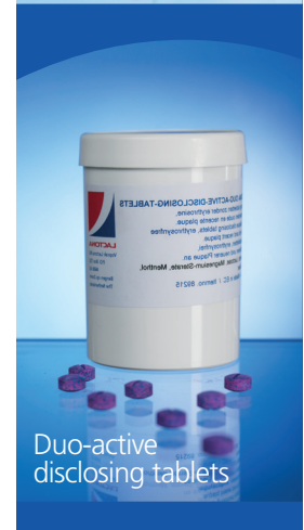
Duo-active disclosing tablets