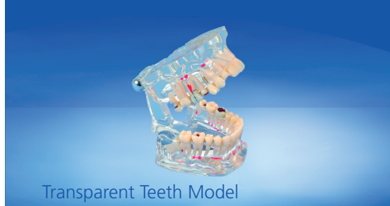
Transparent Teeth Model