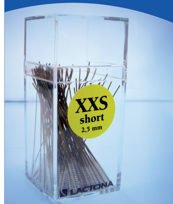
Box Interdental Cleaners